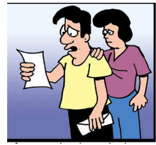
"Its from the church...we've been called up for active duty."